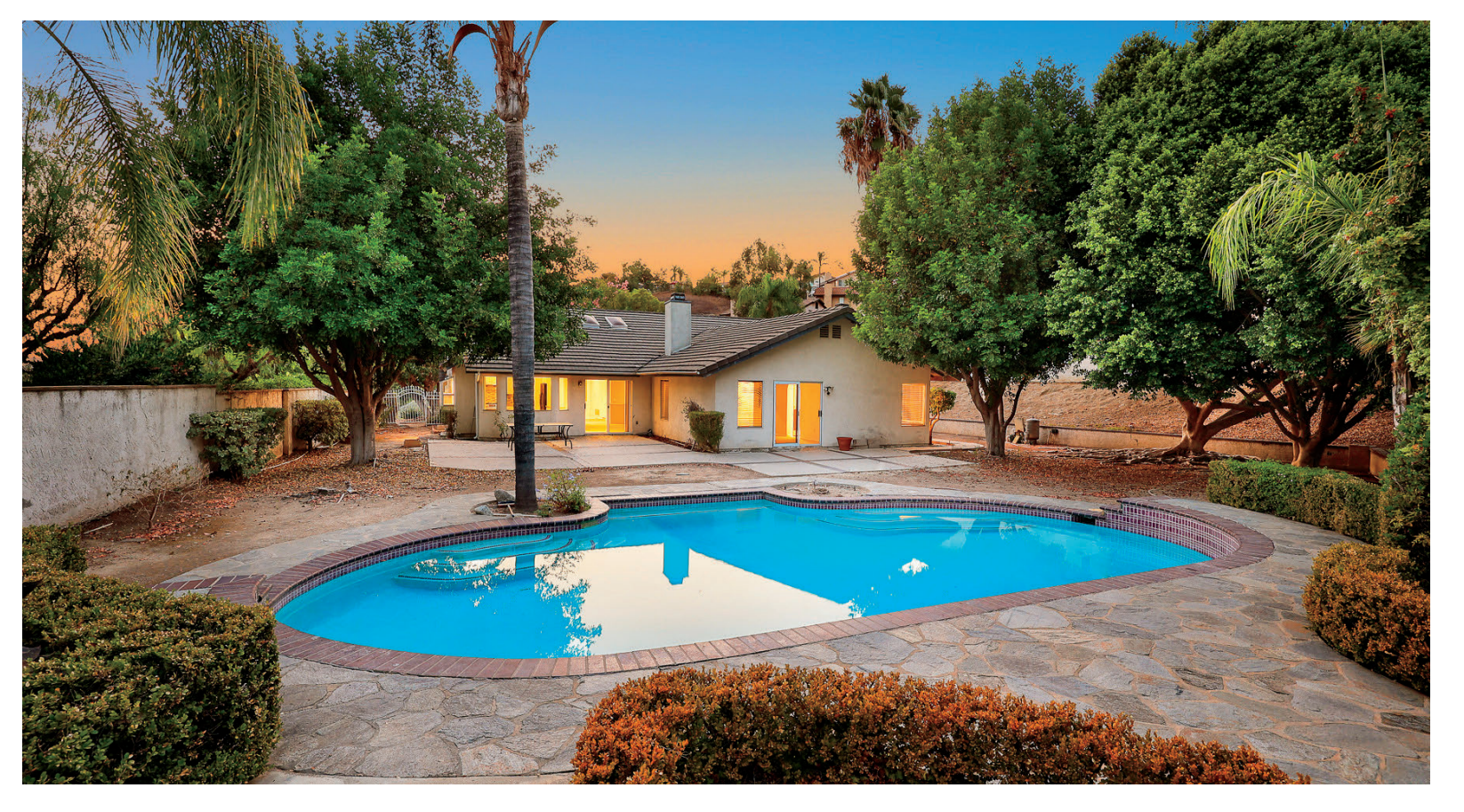
Single Family Residence (Detached) Lot Area: Est. 31,293 SQFT 4 Beds/2 Baths

Year Built: 1987 Floor Area: 2,053 SQFT 3 Car Attached Garage